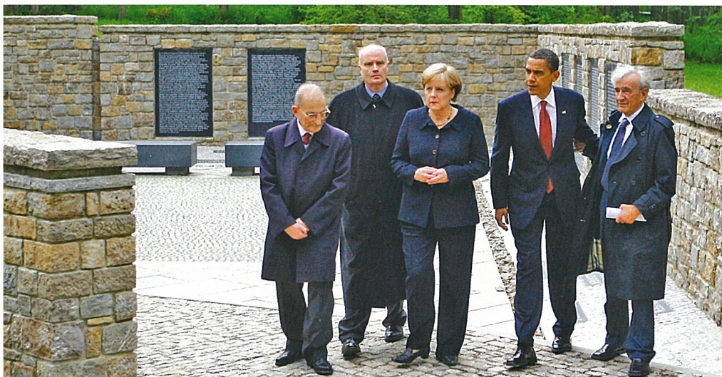
President Barack Obama, German Prime Minister Angela Merkel, and Nobel Prize laureate Elie Wiesel tour the Commission-built memorial on the site of the Buchenwald concentration camp's "Little Camp," where Wiesel was imprisoned during the Holocaust.