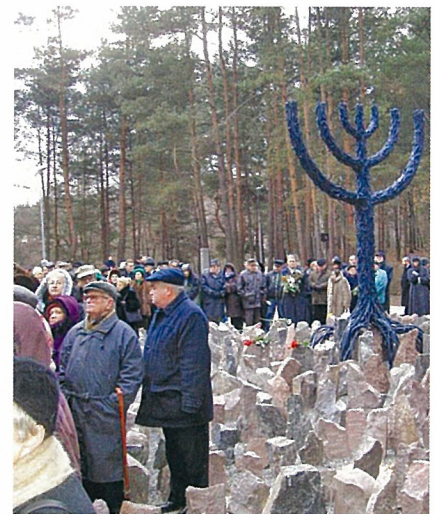
Rumbula, Latvia, Holocaust memorial made possible by Commission fundraising.