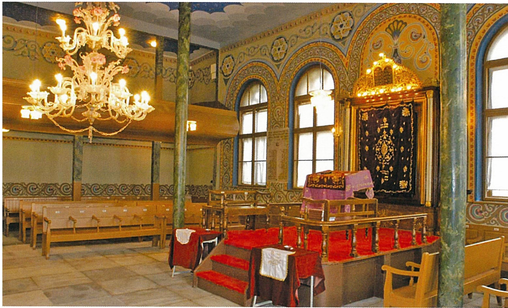
Interior of the Commission-restored synagogue in Plovdiv, Bulgaria.