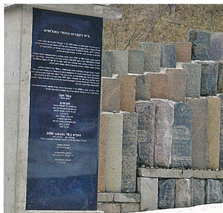
Commission-built memorial at Uzupis Jewish cemetery in Vilnius, Lithuania.

The Commission co-sponsored the installation and dedication of a memorial plaque in Ladino, the Judeo-Spanish language, at the Auschwitz camp memorial.