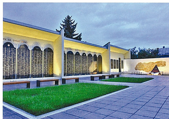
Bardejov, Slovakia, Holocaust memorial.

At the direction of the U.S. Congress's committees on appropriations, the Commission did a preliminary survey of sites abroad associated with foreign-born heroes of the American Revolution. Its report prompted a New York State Supreme Court justice to propose a memorial recalling Philip Mazzei, a neighbor of Thomas Jefferson, whose