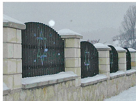
Walls of Jewish cemetery in Ozarow, Poland, built with support of the Commission.