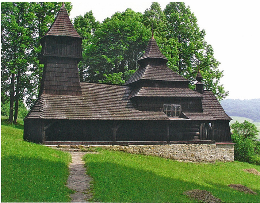
Commission planning and fundraising made possible restoration of this Greek Catholic wooden church in Lukov Venecia, Slovakia.

Greece, and the Balkans who were Jewish to escape the Holocaust.